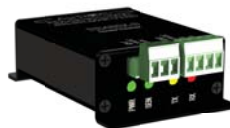
RS485X-Box RS485 to Analog 0-5VDC for remote reporting