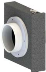
SAGE-EFK-TT-SV EFK Pass Through Filter Housing